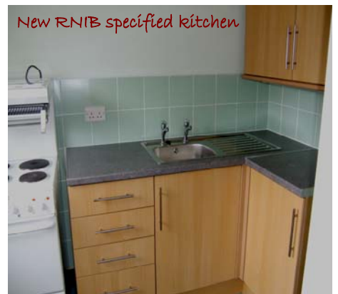
New RNIB specified kitchen

The new design kitchens and bathrooms meet the RNIB specifications for people with visual impairments. We are the first Welsh Housing Association to incorporate these standards into an improvement programme. The tenants are all very pleased with these improvements.