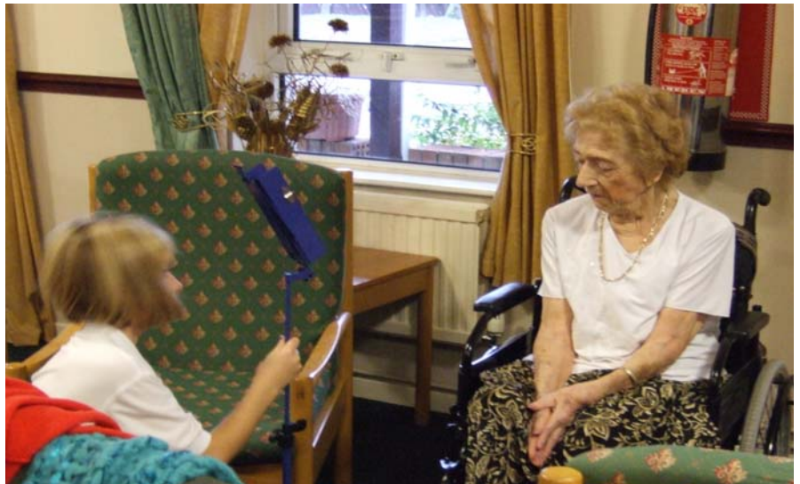
A pupil and resident take part in the project at Cwrt Alun Lewis

One of the residents told the pupils how she left