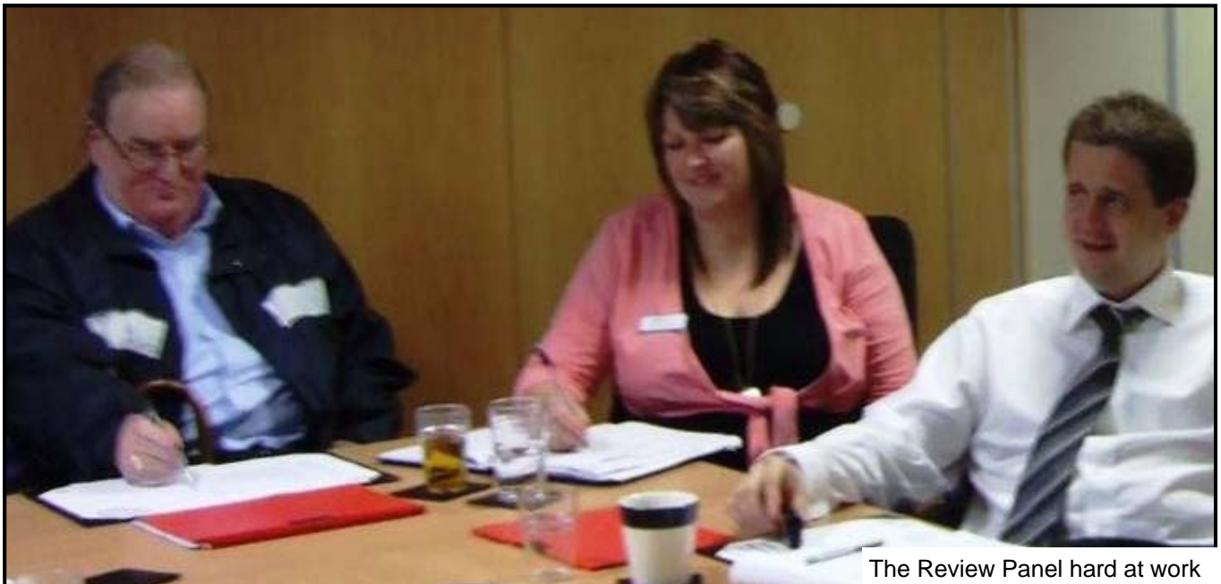
The Review Panel hard at work

As you are aware the Association is a member of the DevCo Consortium, which is a group of housing associations working collaboratively to organise new developments, improve services to our tenants and ensure the services we provide are cost effective.